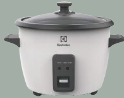
E2RC1-220W Rice cooker