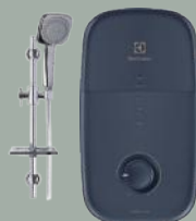
EWE361LB-DIX4 DC Pump