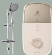
EWE361LA-DAX4 AC Pump