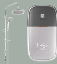
EWE361MA-DST1 AC Pump (Rain shower)