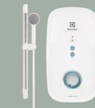
EWE361KB-DWB6 DC Pump