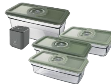
EAVFK1 EVFB1 EVRB1