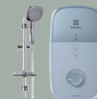
EWE361LX-DBX4 No Pump