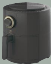
E6AF1-220K Air Fryer