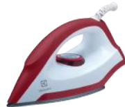
EDI1004 Dry Iron