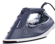
E6SI3-61NW Steam Iron