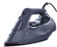
E6SI3-62MN Steam Iron