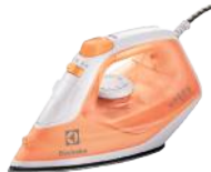
ESI4007 Steam Iron