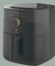
E6AF1-520K Air Fryer