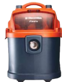
FLEXIO II Z931 (1,600W, 30L Capacity)