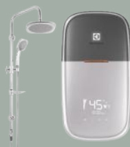
EWE361MB-DST1 DC Pump (Rain shower)

Our stylish and slim Scandinavian design blends into any modern home