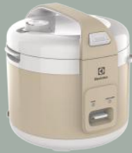
E4RC1-350B Rice cooker