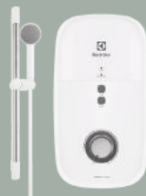
EWE361KB-DWG6 DC Pump