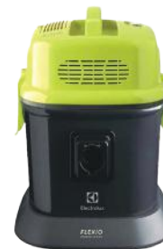
FLEXIO Power Clean Z823 (Bagless Canister 1,400W, 20L Capacity)