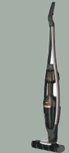
NEW PQ92-3EMF 25.2V Pure Q9P Cordless vacuum cleaner