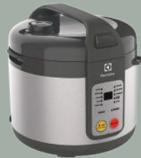
E4RC1-680S Rice Cooker