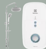
EWE361KB-DWB1 DC Pump (Rain shower)