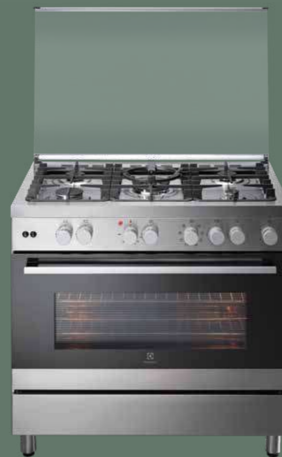
90cm UltimateTaste 700 free-standing cooker with gas hob and 130L electric oven

Extra large 130L oven with double fan assist for even heat distribution lets you cook more food at the same time.